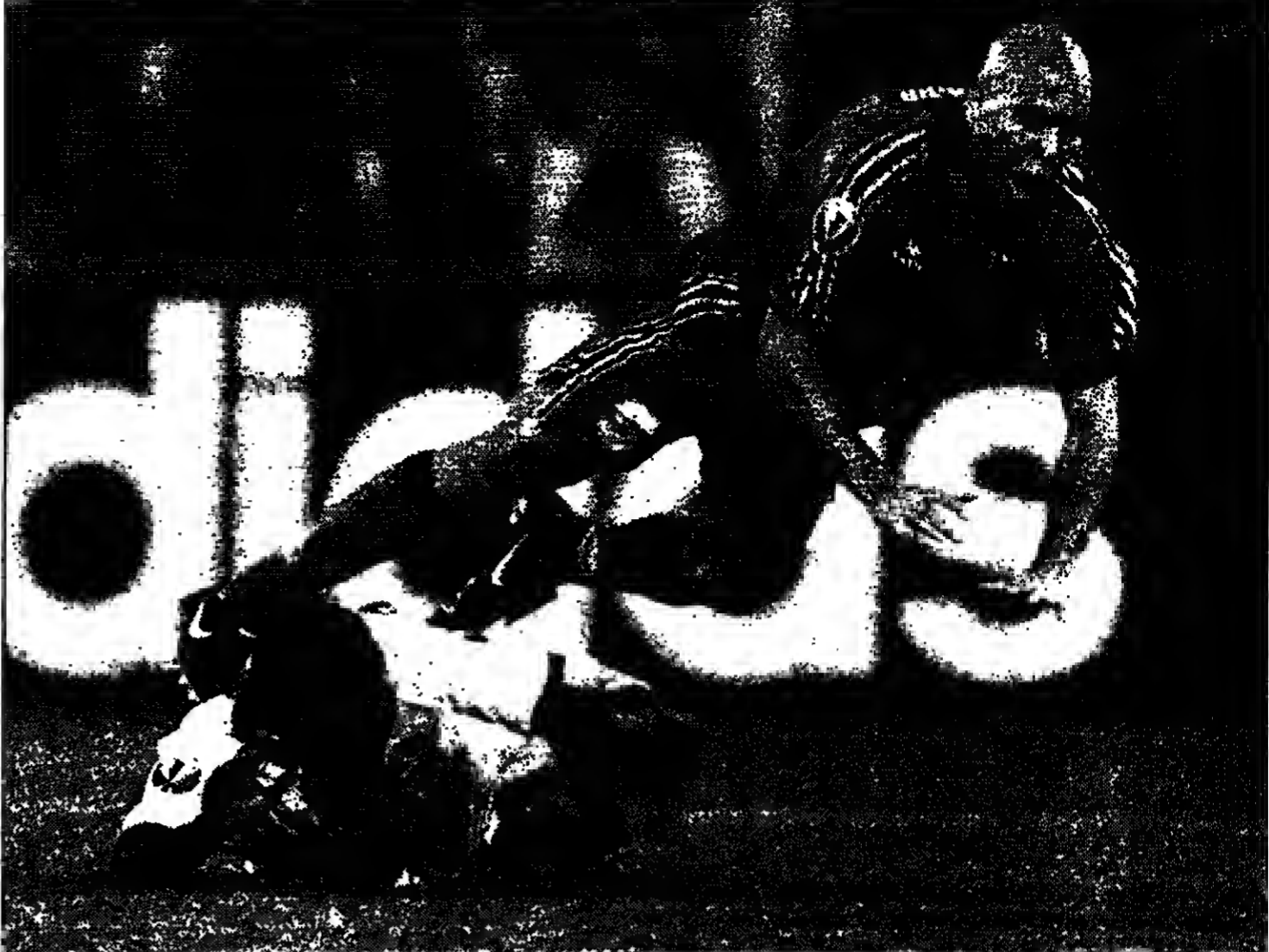
PROFITABLE TRIP - Barcelona's Ronaldo flies through the air after being fouled in the area by PSG's Bruno N'Gotty in the European Cup Winners' Cup final in Rotterdam last night. Ronaldo himself converted the penalty which turned out to be the winning goal for the Catalan side.

Barcelona were unlucky not to double their score three minutes from time when Luis Figo hit the bar with Lama well beaten.